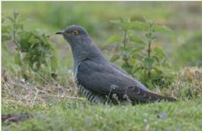
cuckoo