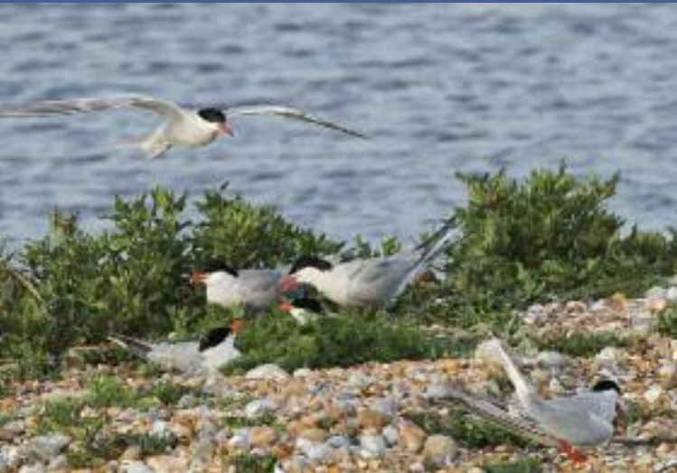
common terns