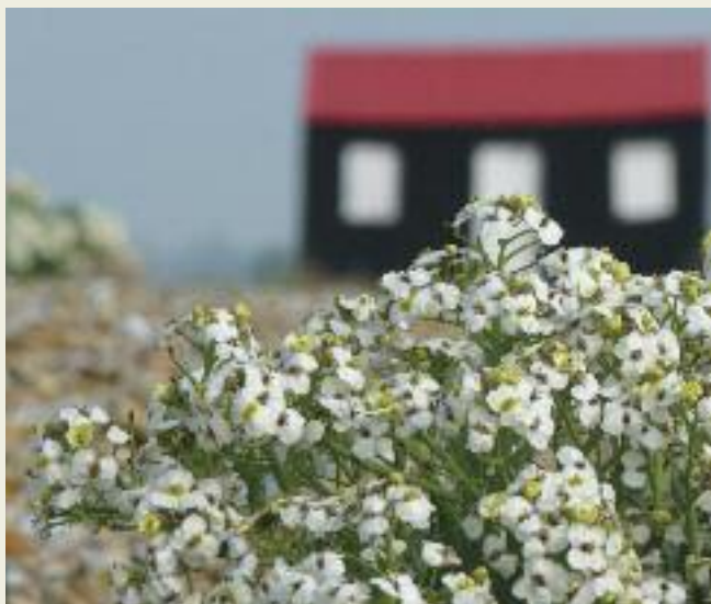
sea kale