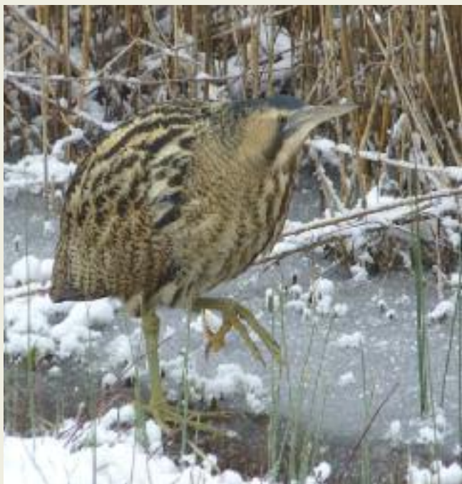
bittern © Barry Yates