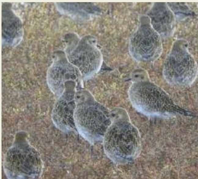
golden plovers