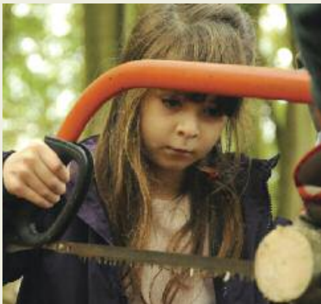
Wildlife Watch