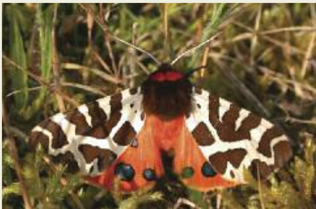
garden tiger moth