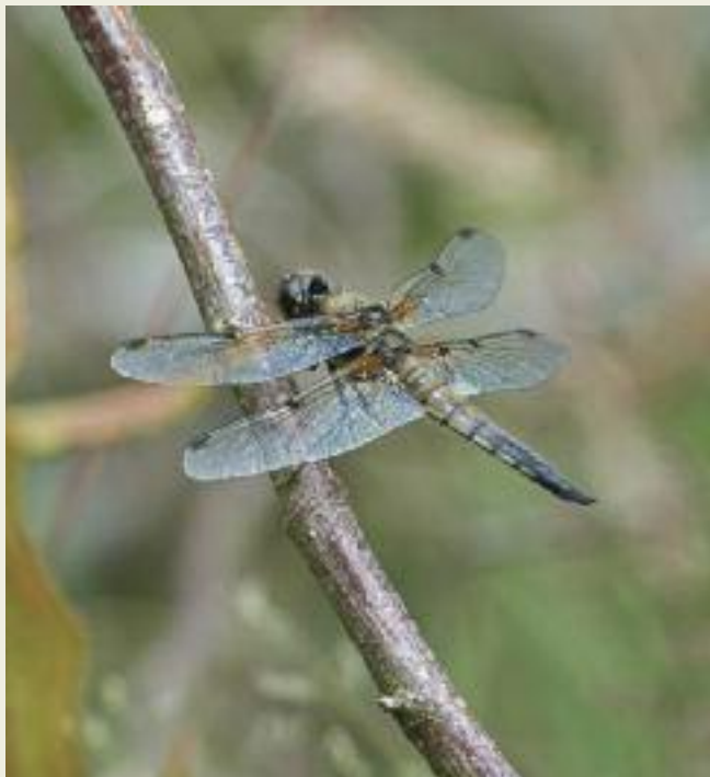
four-spotted chaser dragonfly © Lisa Geoghegan