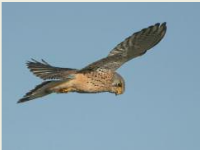
kestrel