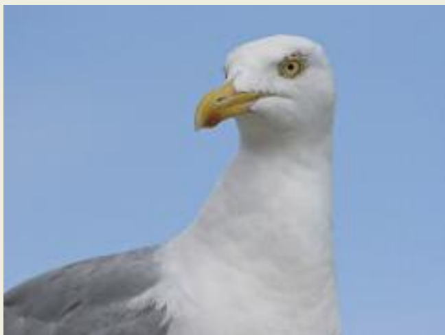
herring gull